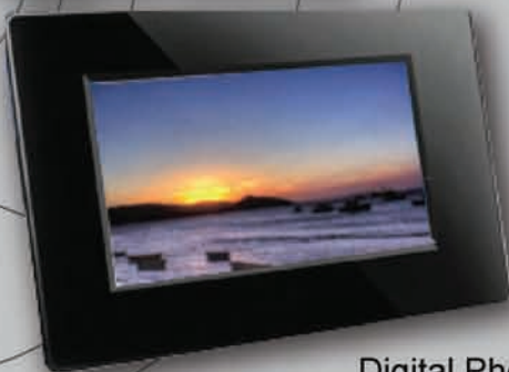
Digital Photo Frames